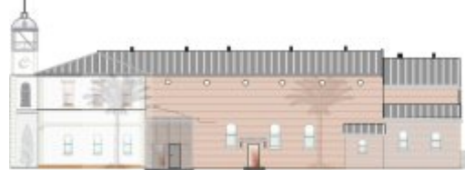
Eastern Elevation Storm Lane