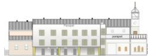
Western Elevation Market Street