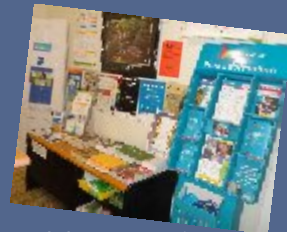
Health Promotion Tourist Information

"I think we can make the music workshop work! That's a great idea" .....I an, band player, tutor